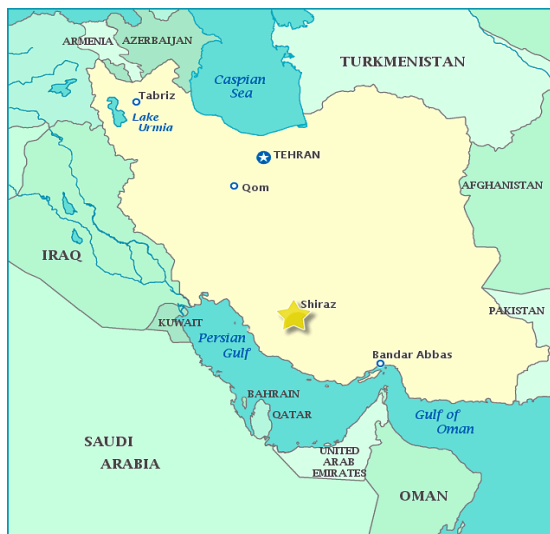
Figure 2: Shiraz location in Iran map

Semi-structured interviews with 17 teenagers were conducted at the four selected high schools over a period of three weeks in October 2012. These teenagers were chosen from males and females between the ages of 15 and 18. The participants were chosen from four randomly selected high schools in four different socioeconomic status areas of "Shiraz." A requirement for participation was that the respondents should have visited urban parks in Shiraz once or more times in the six months preceding the interviews. Participants freely chose to participate and share their experiences.