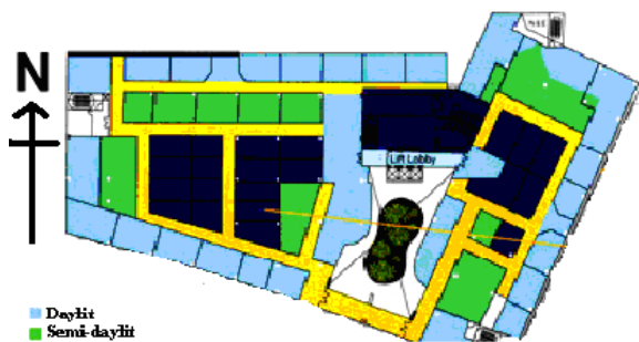
Figure 1: The interior space layout of LEO Building shows the office areas are designed along the facades to maximise the use of daylight

Figures 1 and 2 show that both buildings are L-shaped on plan with the main facades facing north and south. Most office areas are designed along the facades to maximise the use of daylight.