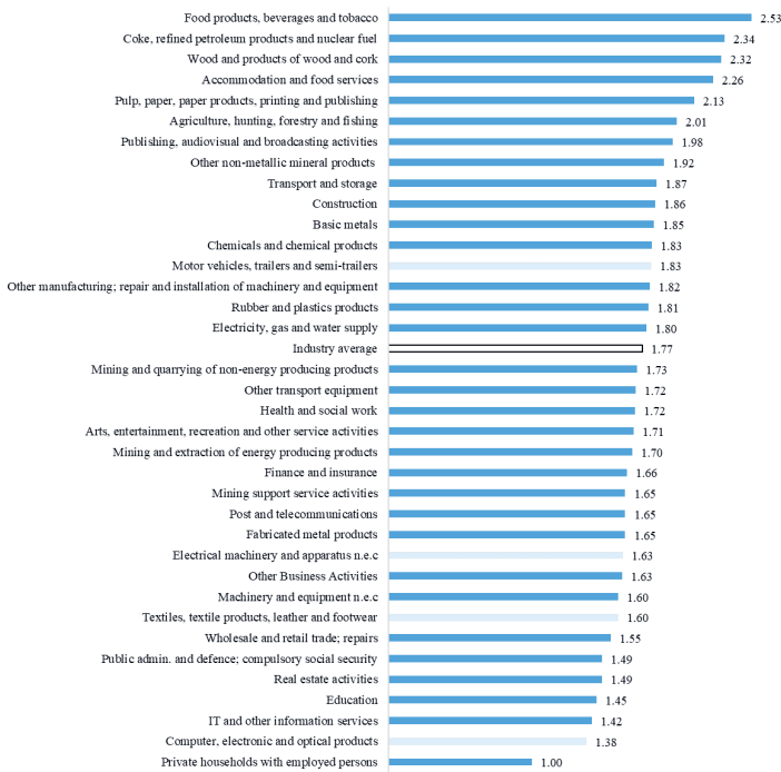
Figure 2. Multiplier Effects by Industry, Vietnam, 2015

Notes: (a) The total domestic backward linkage effects are calculated from the Leontief inverse matrix of the input-output table. For the full description of each sector, refer to the OECD Input-Output table; (b) Industries highlighted in light colour are Vietnam’s strategic industries.